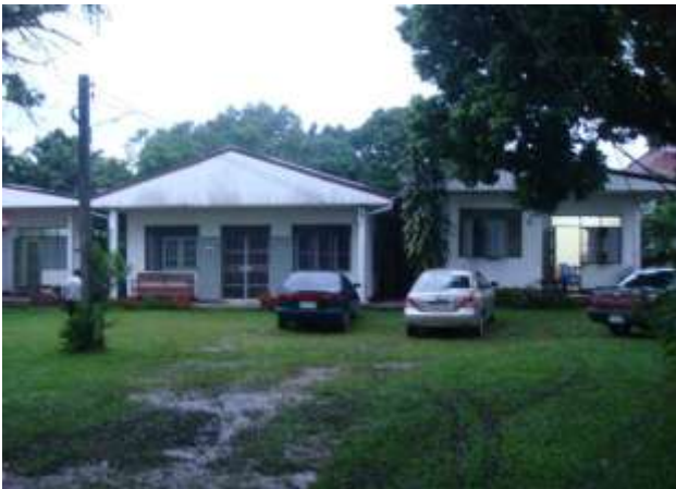
Northern Training Center